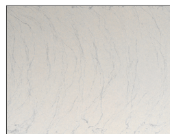
COVERAGE TOO LIGHT