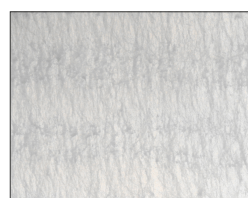
CORRECT APPLICATION = 20 dry gms/sqm