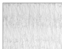
CORRECT APPLICATION = 20 dry gms/sqm