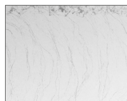
COVERAGE TOO LIGHT